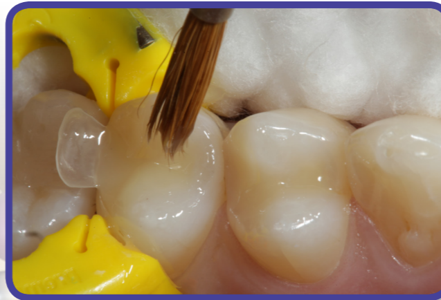
Fig 9. A sable artist's brush is used to adapt the restorative material to the cavity margins and remove excess material prior to light curing. Note: ACTIVA BioACTIVE-RESTORATIVE is a dual cure material.