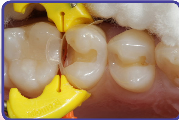
Fig 4. Cavity preparations for tooth No. 4 DO is made using a carbide # 330 (SS White) and tooth No. 5 using a fissurotomy bur (SS White).