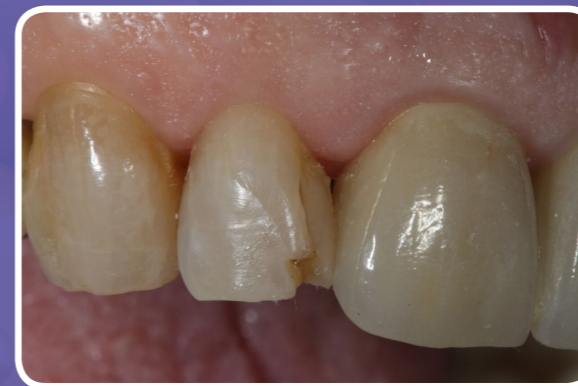
Fig 16. Preoperative view of a failing mesio-incisal Class IV composite (tooth No. 7) on a 78-year-old patient. Recurrent decay and marginal leakage are present. Geriatric patients can be more prone to recurrent decay due to decreased salivary production and less effective home care.