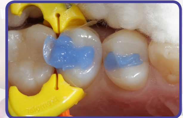
Fig 5. Total etch protocol for 15 seconds, then thoroughly rinsed with water.