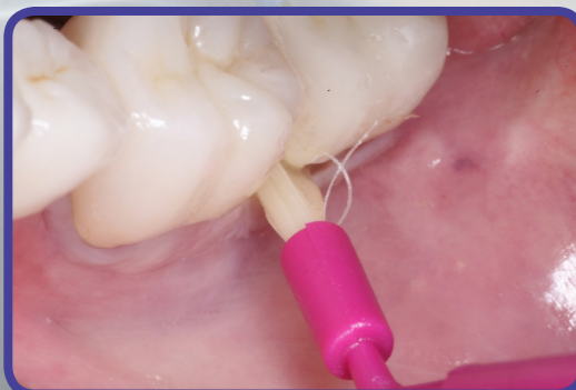
Fig 13. Fluoride varnish is applied at recall appointment (Embrace Varnish, Pulpdent Corporation).