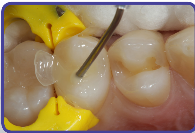
Fig 8. ACTIVA BioACTIVE-RESTORATIVE is dispensed into the cavity preparation of tooth No. 4. The sectional matrix (Biofit, Bioclear) confines the restorative material precisely to the cavity preparation.

The viscosity of ACTIVA is similar to heavy-bodied flowable resins and will adapt well to the internal geometry of any cavity preparation. A sectional matrix system is recommended for Class II placement to limit the material to the preparation and avoid proximal excess. Anatomic detail can be obtained by using rotary instrumentation. A narrow “bullet type” 20 fluted finishing carbide (SS White) is recommended to carve precise anatomic detail.