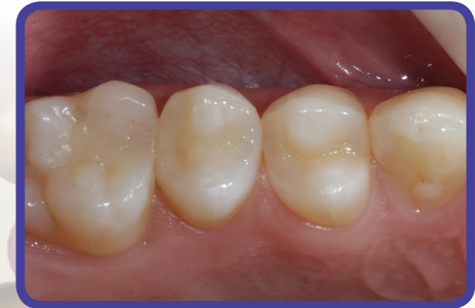
Fig 10. An occlusal view of the completed ACTIVA restorations on teeth Nos. 4 and 5.