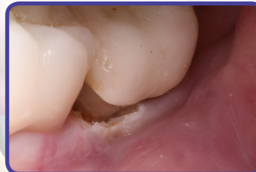
Fig 12. After removal of the decay, the cavity was restored using ACTIVA BioACTIVE-RESTORATIVE material.