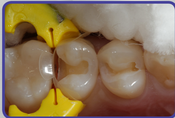
Fig 6. An occlusal view after etching and drying the preparations.