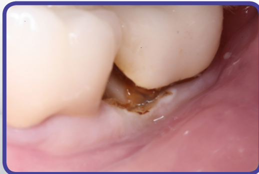
Fig 11. Root caries was found at recall examination on the facial surface of tooth No. 18 below the crown margin. A diode laser was used to gain access for evaluation and potential restoration.

ACTIVA BioACTIVE-RESTORATIVE can be used 1) to restore root caries on exposed root surfaces where gingival recession is present, and 2) below existing full coverage restorations where access is not an issue. Minor surface finishing is accomplished with a composite carbide finishing bur (ET3, Komet USA), followed by use of fine rubber abrasives to gain a final surface finish. A postoperative photograph shows the final result after restoring the root surface decay. At future recall appointments, fluoride varnish is applied to recharge the ACTIVA BioACTIVE-RESTORATIVE material to help protect the root surfaces and restorative margins from a recurrence of root caries.