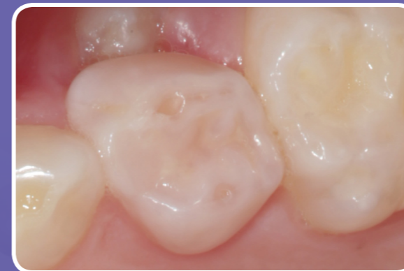
Fig 15. A postoperative occlusal view of an MO ACTIVA restoration on primary tooth No. 1. Tooth No. 12 is seen about to erupt. The patient is only 10 years old, so tooth No. 1 will not exfoliate for a year or more. It is therefore important to maintain tooth 1 restoratively as a space maintainer until tooth No. 12 erupts into the oral cavity.

Some of the challenges listed above exist in the geriatric population as well. In addition, the decrease in quality and quantity of saliva may make older patients more susceptible to recurrent caries. Bioactive restoratives like ACTIVA can help protect these patients' dentition by releasing and recharging essential minerals.