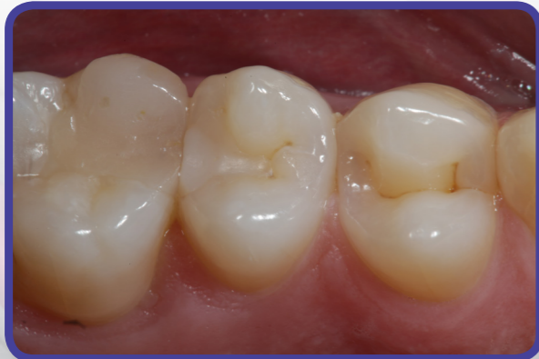
Fig 3. A preoperative occlusal view of tooth No. 4 which has an existing DO composite with recurrent decay and tooth No. 5 with occlusal pit and fissure decay.

Cavity preparation for ACTIVA BioACTIVE-RESTORATIVE is similar to that for conventional composite materials (Figure 3 and Figure 4). Placement is easy using the automix syringe and dispensing cannula (the latter can be bent to an appropriate angle for ease of delivery). A total etch or selective etch protocol and an adhesive bonding agent can be used.