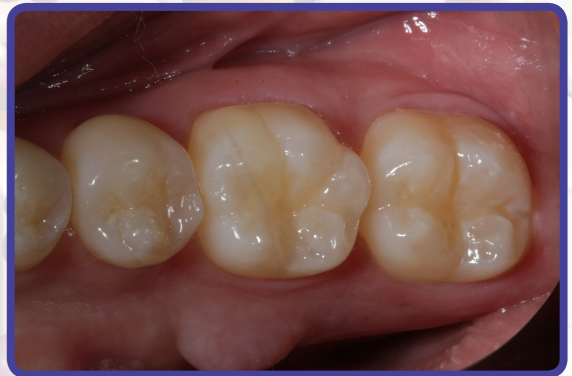
Fig 2. Final restoration.