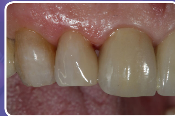
Fig 17. Postoperative view of the mesio-incisal ACTIVA-BIOACTIVE RESTORATIVE restoration on tooth No. 7. A beautifully esthetic result. A bioactive restorative material such as this will provide greater protection than a conventional composite material.