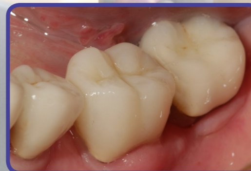
Fig 14. A two year postoperative view of the ACTIVA BioACTIVE-RESTORATIVE root caries restoration on the facial aspect of tooth No. 18.

According to the manufacturer, ACTIVA BioACTIVE-RESTORATIVE is the first dental resin that mimics the physical and chemical properties of teeth. It contains three key components: 1) Bioactive ionic resin matrix. 2) Shock absorbing rubberized resin component, and 3) Reactive glass ionomers fillers.