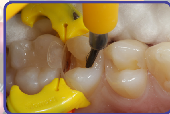
Fig 7. Placement of an adhesive resin on all preparation surfaces is shown.