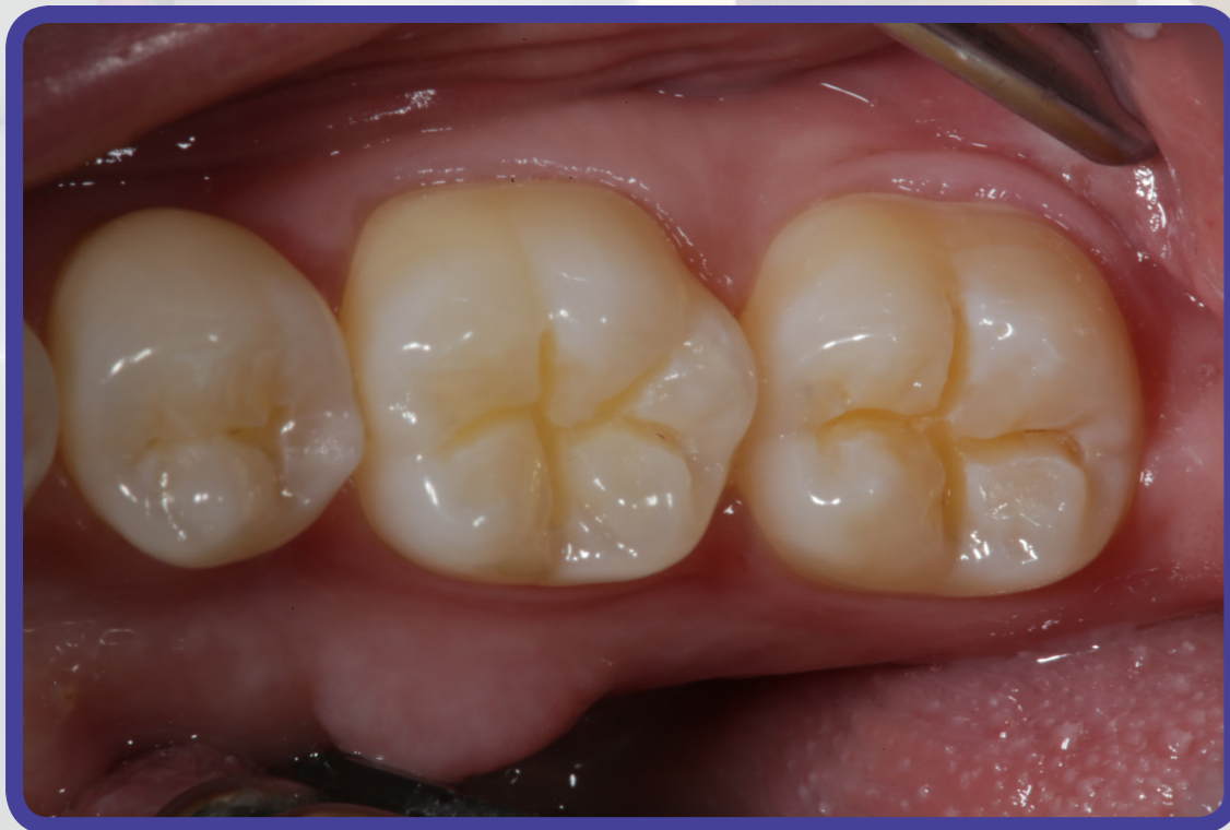
Fig 1. Micro preparation of pits and grooves using a fissurotomy bur (SS White).

Bioactive materials like ACTIVA BioACTIVE-RESTORATIVE can be used for a wide variety of clinical applications, including minimally invasive restorations. Figure 1 shows a micro preparation to conserve a maximum amount of tooth structure after decay was detected in the occlusal pits and grooves of teeth Nos. 29, 30, and 31. ACTIVA seals the enamel and dentin (Figure 2), protecting against microleakage. Placement is simple thanks to the precision of the metal cannula delivery system, eliminating excess and requiring minimal or no finishing.